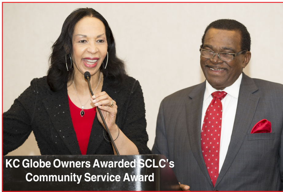
KC Globe Owners Awarded SCLC's Community Service Award